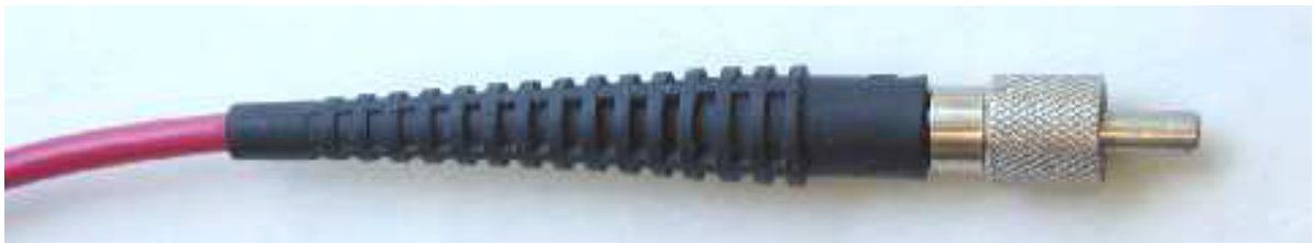
SMA termination with boot

The most likely entry point for water is where the cable's outer jacket enters the fiber optic connector. This is normally covered by a strain-relief "boot" as shown below. This boot may or may not form a seal by itself.