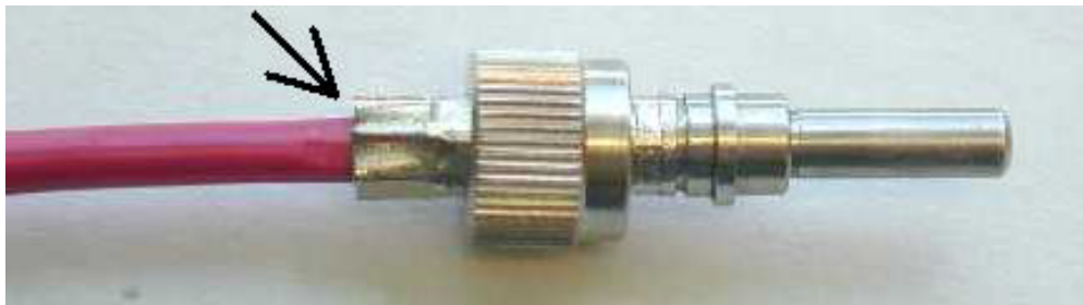
SMA termination with boot removed

The arrow in the lower picture marks the point where the jacket enters the connector. At some point inside the connector the jacket ends, at which point it must be sealed. In high-quality commercial cables the connector is typically filled with epoxy, encapsulating the jacket and providing an adequate seal. However since the seal is internal the only way to be sure is to consult the manufacturer.